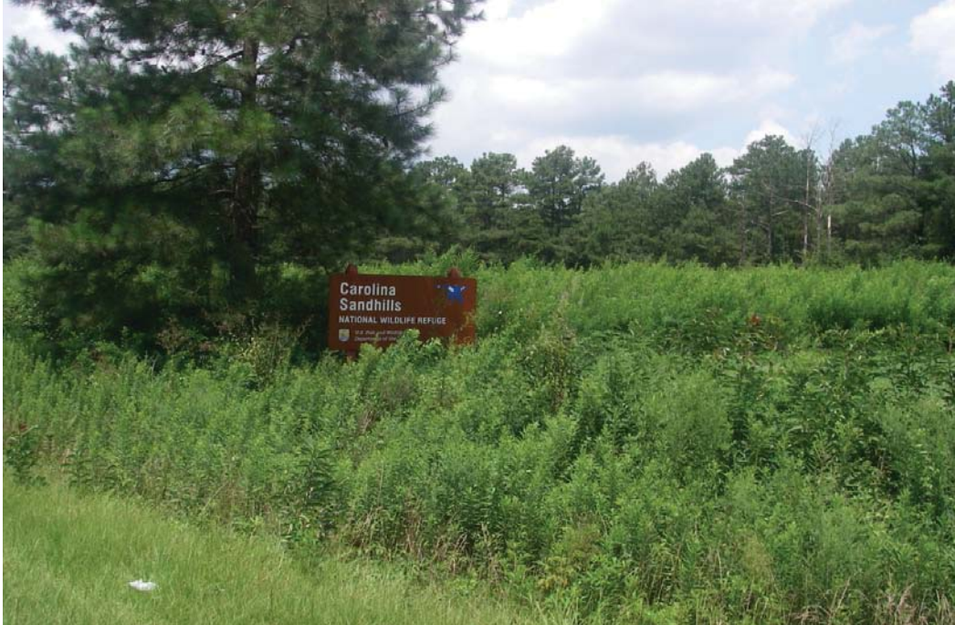
Photo 1: The Carolina Sandhills National Wildlife Refuge entrance sign is covered with vegetation and appears to be of substandard height.