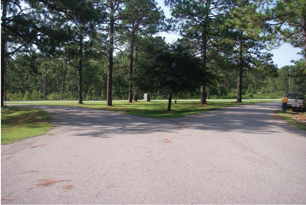
Photo 3: Wildlife Drive north entrance Y-intersection Stop sign to US Rte 1 approaches does not conform to MUTCD