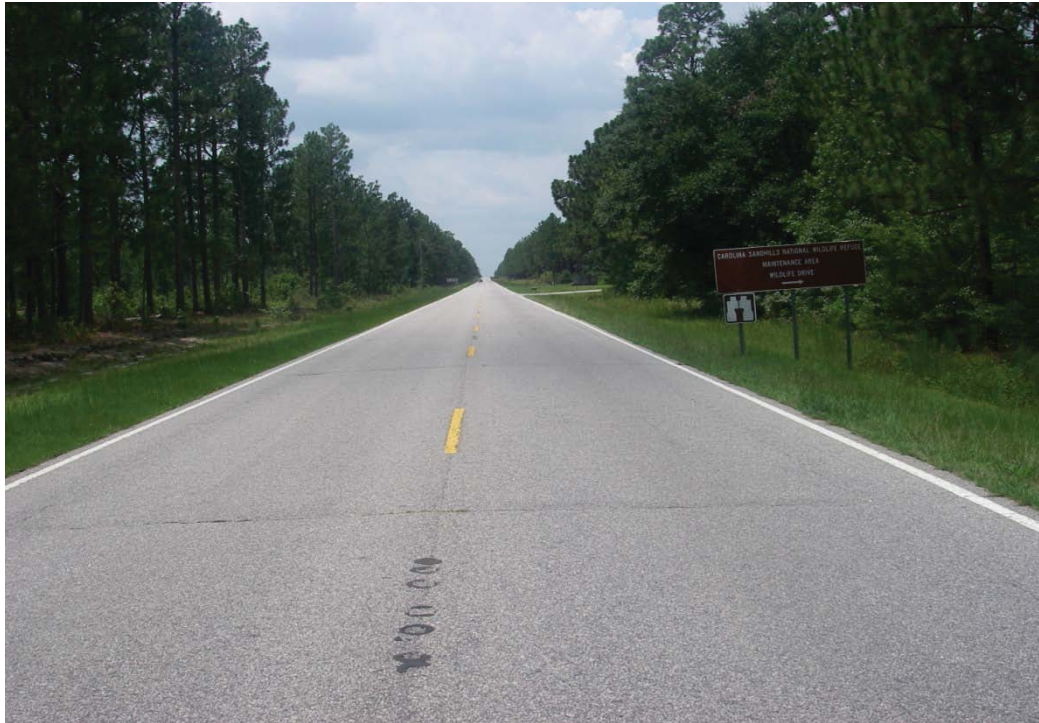
Photo 5: Refuge Maintenance Entrance Area sign obstructs sight distance, looking northbound from the Wildlife Drive North Entrance. Also, passing is permitted along US Rte 1.