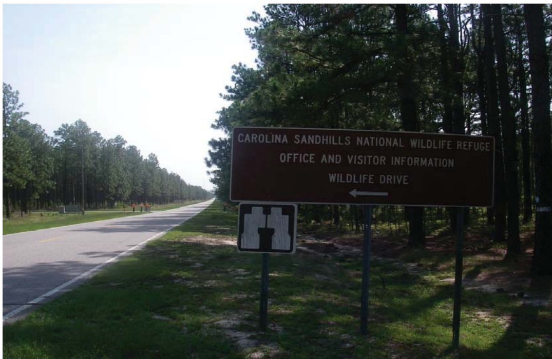
Photo 9: Northbound US Rte 1 showing Carolina Sandhills National Wildlife Refuge Office/Visitor Information Wildlife Drive - no advance guide sign prior to Refuge sign