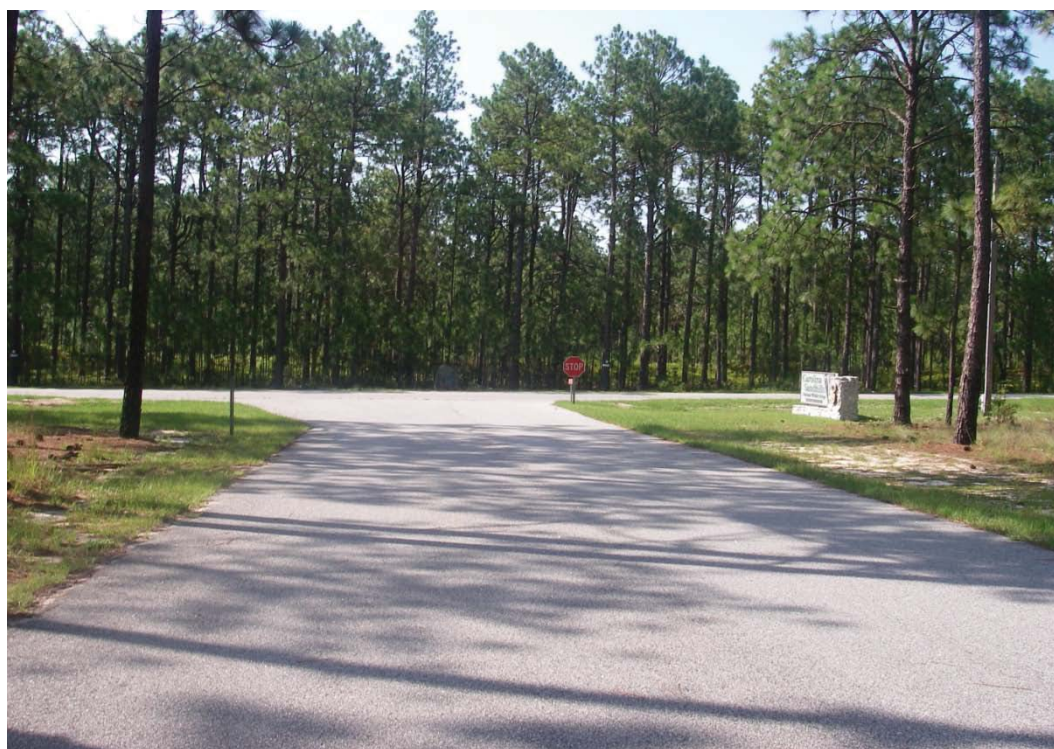
Photo 10: Southbound showing Wildlife Drive South Entrance to US Rte 1. Stop sign does not conform to MUTCD