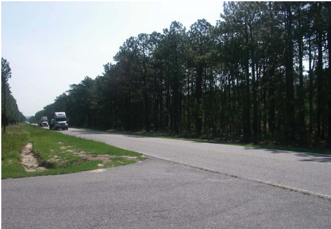
Photo 8: Presence of large semitrailers heading northbound US Rte 1