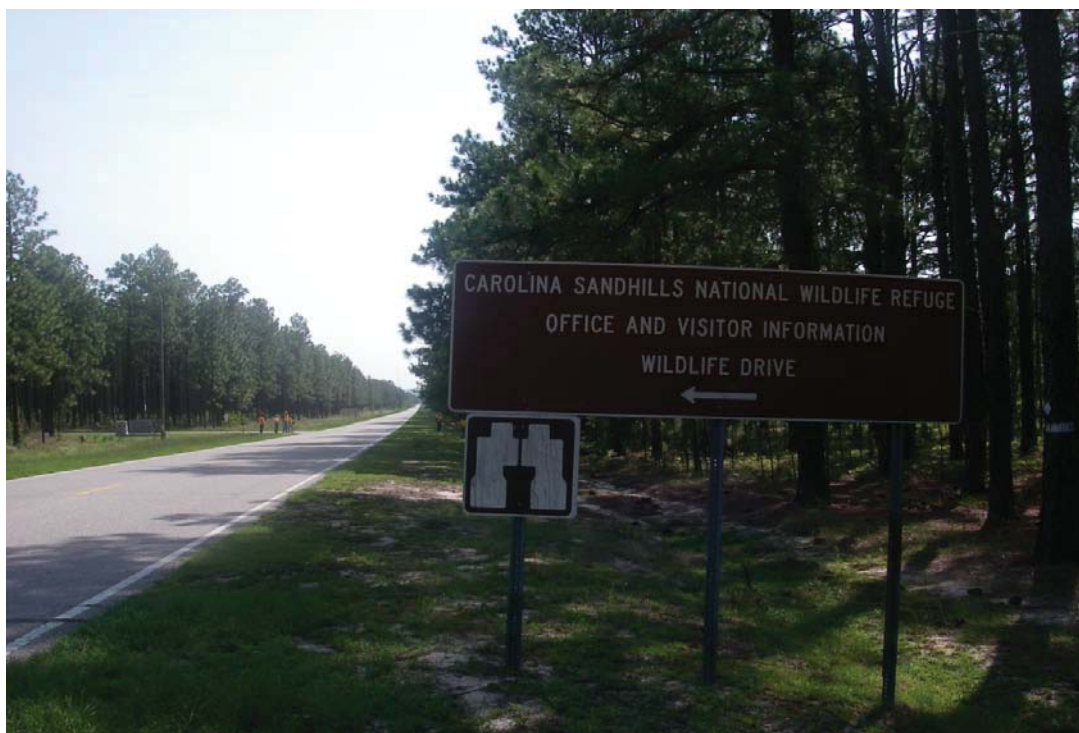
Photo 6: Northbound US Rte 1 showing passing at the Wildlife Drive South Entrance intersection