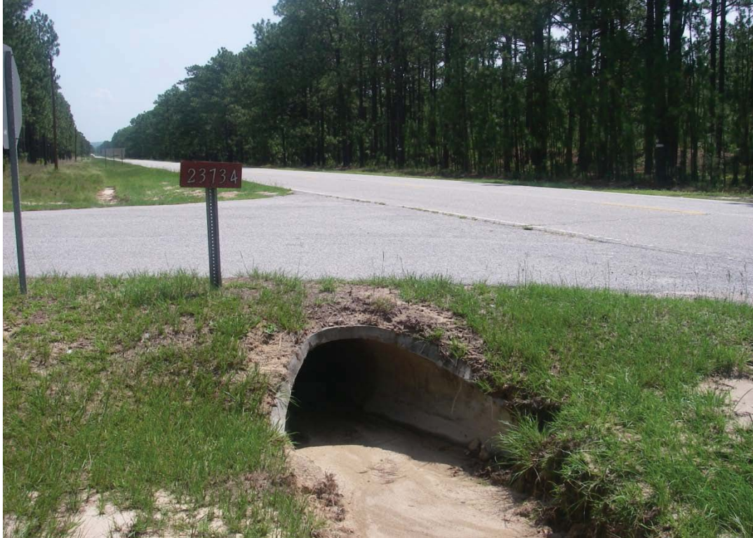
Photo 11: Culvert at Wildlife Drive South Entrance protrudes the clear zone