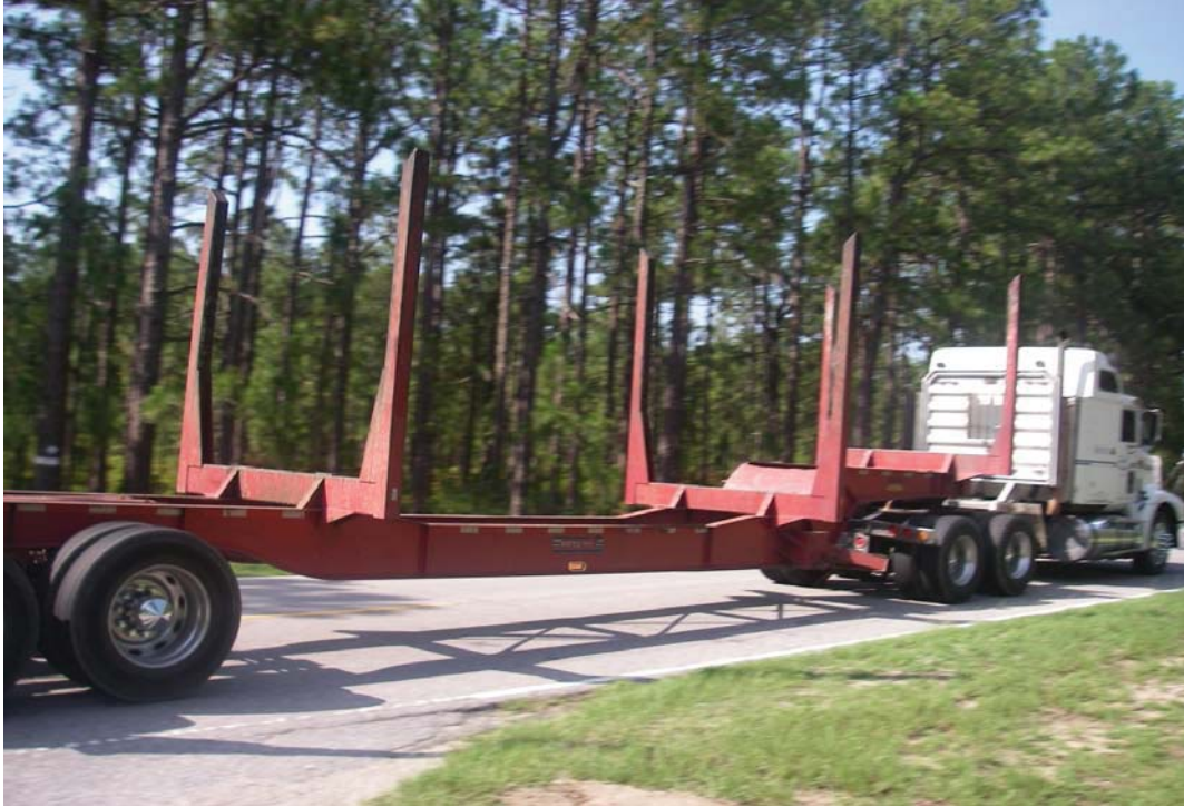
Photo 7: Presence of large semitrailer heading southbound along US Rte 1