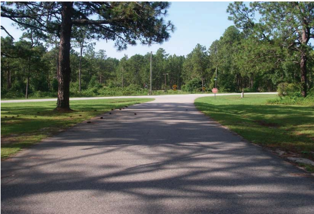
Photo 4: Wildlife Drive north entrance Y-intersection Stop sign to US Rte 1 approaches does not conform to MUTCD