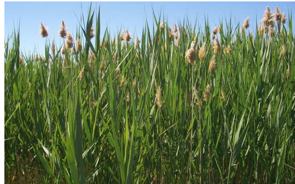
A Phragmites stand at Bear River Migratory Bird Refuge

Common reed, Phragmites australis , is a tall, native, warm-season, sod-forming grass. It has a worldwide distribution (Tucker 1990) and is endemic to North America (Niering & Warren 1977). The culms are erect, rigid, smooth, and hollow. The culms may be nearly 1 inch in diameter and from 6 to 13 feet tall, terminating in a 12-inch-long dense panicle. Common reed has an extensive rhizome network and occasionally produces stolons as well.