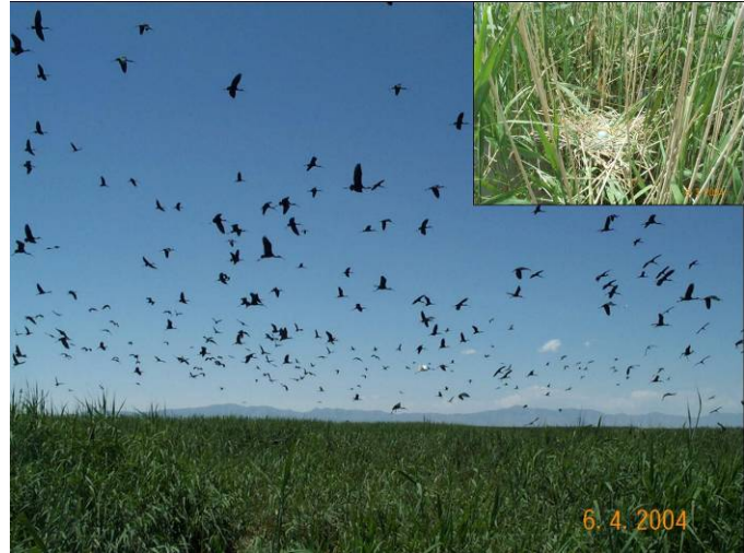
Waterbird colony and nest in Phragmites , Bear River Refuge.

Phragmites is also used for nesting strata at Bear River Refuge. In 2002, a colony of nesting waterbirds was discovered using the Phragmites /alkali bulrush stand in Unit 5B. The unit has been used annually (2002-2007) by breeding white-faced ibis, black-crowned night heron, cattle egret, great egret, snowy egret, and great blue heron. Franklin's gulls utilized only the alkali bulrush component of the emergent vegetation for nesting 2002-2005. By 2006, virtually all the alkali bulrush stands that once occupied this unit had been replaced by Phragmites . After this time, no Franklin's gull nests have been found.