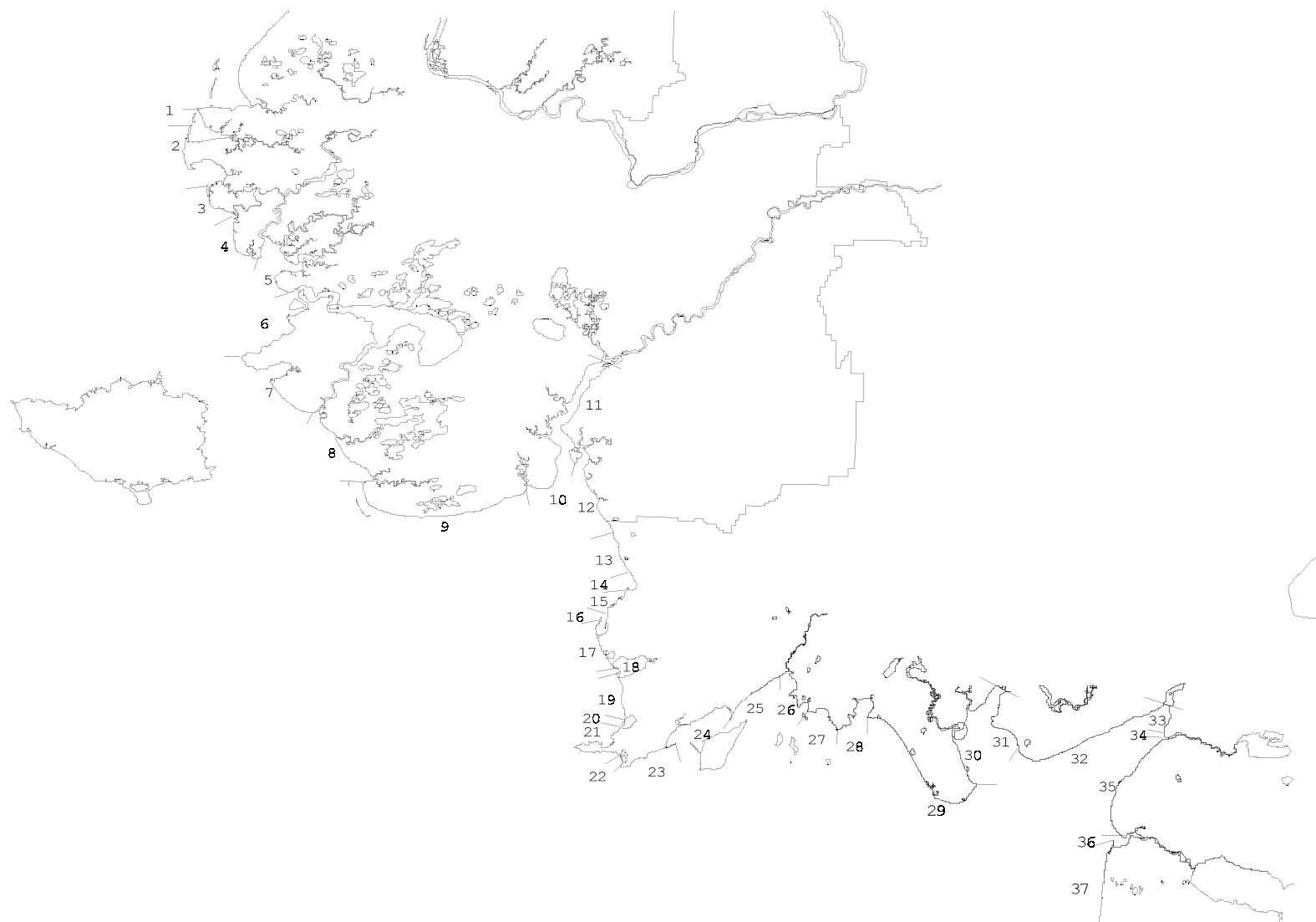
Figure 1. Map of emperor goose aerial survey segments 1-36 in southwest Alaska, 1992-2009.