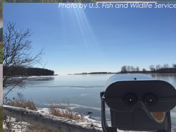
The view from the new spotting scope at the Gibraltar Bay Unit.