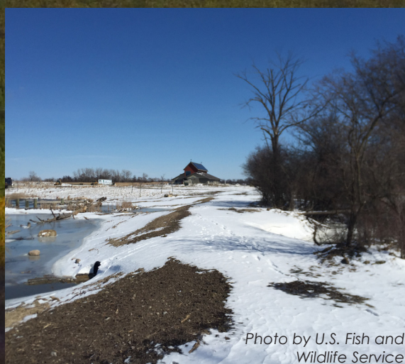
Infrastructure upgrades at the Monguagon wetland allow for better flood protection and water level control.