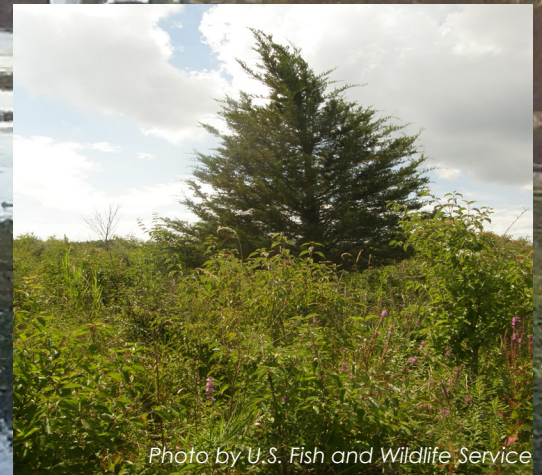
A Red cedar ( Juniperus virginiana ) tree at the Strong Unit.