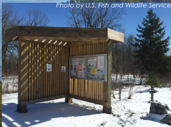
A new kiosk at Gibraltar Bay Unit.