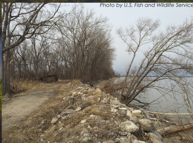
A dike, rebuilt this year, protects Ford Marsh Unit from being flooded by Lake Erie during high water events.