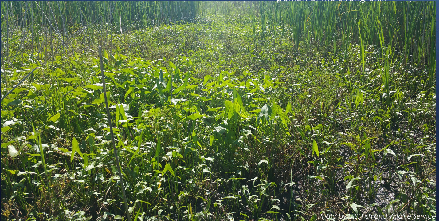
State-threatened giant arrowheads thrive in the Strong Unit.