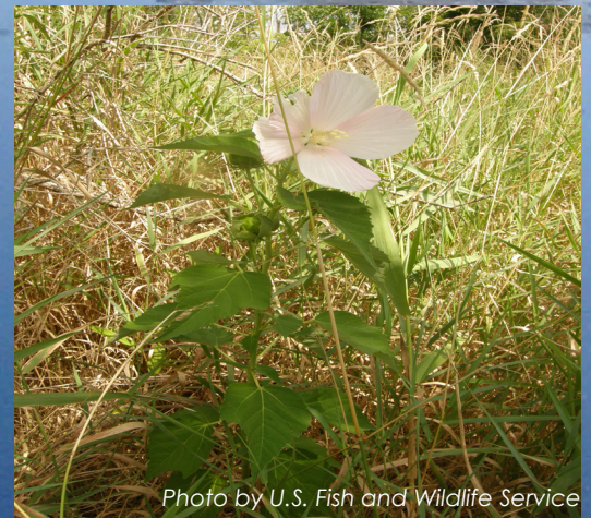
Rose mallow ( Hibiscus moscheutos ) growing in the shrub-carr habitat portion of the Strong Unit.