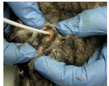
Cloacal swabbing technique.