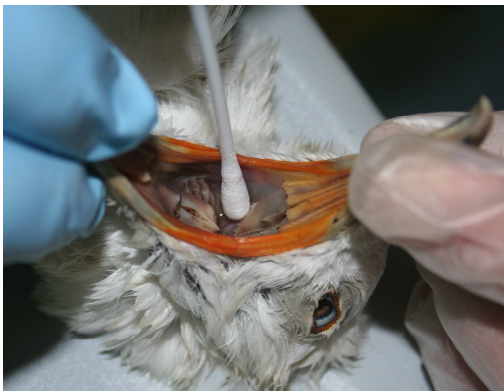
Oral swabbing a dead ring-billed gull.