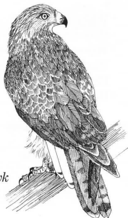
Red -Tailed Hawk

___ Golden-crowned Kinglet _____ c c c ___ Ruby-crowned Kinglet _____ c a u