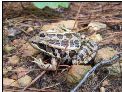
Figure 7: Pickerel Frog captured at site two.

A total of 11 sites were examined at different degrees of analysis utilizing a combination of techniques to obtain a baseline indication of amphibian occupancy on the Refuge (Table 1). We encountered 15 species of anurans and ten species of caudata during our inventory of the Mountain Longleaf NWR (Table 2). We tested for Bd at three sites during December 2012 and at three sites in June 2013. No malformed amphibians were found and all samples tested negative for the presence of Bd .