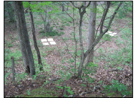
Figure 4: Portion of coverboard transect at site seven.

Coverboards: Artificial cover was created from non-treated plywood cut to the dimensions of 60 cm X 60 cm. A total of 24 boards were arrayed in groups of four (Figure 4) a few centimeters from each other along a linear transect 10 meters apart (Dodd, 2003). They were emplaced at four locations in July of 2012 to allow them to age properly and provide secure hiding places before we began checking them in September of 2012 and March and June 2013. Artificial covers were deployed at Cave Creek Seep, Upper Marcheta Mountain Seep, Lower Marcheta Mountain Seep and the South Branch of Cave Creek Seep (Figure 3; Table 1).