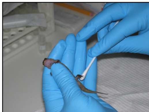
Figure 6: Swabbing a salamander for Bd .

Bd Spore counts were done using a Petroff-Hausser counting chamber followed by DNA extraction utilizing the same procedure used for field samples for use as our positive control. Positive controls consisted of DNA equivalent to approximately 100, 10, and 1 zoospores and a negative control consisting of 15 µL of 10 mM Tris that were run concurrently with field samples.