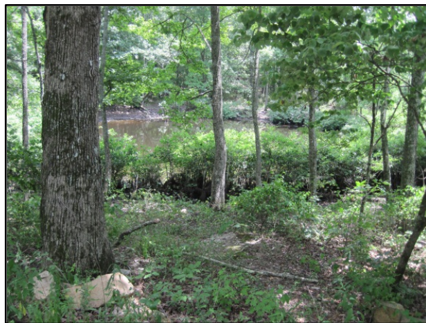
Figure 8: 19D Pond (site ten).

The most comprehensive study of the herpetofauna in the area (Cline and Adams, 1997) was an examination of (former) Fort McClellan which included lands that are now under the stewardship of the U.S. Fish & Wildlife Service. A total of sixteen species of frogs and toads and twelve species of salamanders were reported within the Fort's administrative boundary. The 19D pond was the most intensive site studied on lands currently known as the Mountain Longleaf NWR (Figure 8). We visited this natural spring-fed pond in July 2012 and found predatory fishes (sunfishes, e.g., bass and bream). These fish species can be voracious predators of amphibian eggs and larvae, and can eat adult amphibians as well. The impact on amphibian populations can be severe, and based upon this discovery we did not return to this site.