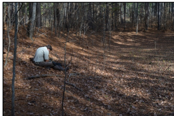
Figure 2: Looking for marbled salamanders at site one in December 2012 before the vernal pond filled with water.

Terrestrial and Aquatic Searches: We conducted terrestrial and aquatic searches at all locations (Figure 3; Table 1) by looking under rocks, leaves and woody debris and by using dip-nets and seines in ponds and streams (Figure 2). Active listening for calling male anurans was also utilized and noted when calls were encountered. Captured animals were identified to species and released at point of capture.