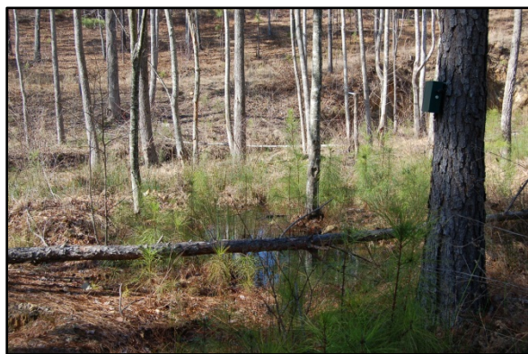
Figure 1: Froglogger attached to a pine tree in riparian zone pool habitat at site six.

We determined species presence/absence across the Refuge's landscape during the timeframe of July 2012 to June 2013. A suite of techniques were employed which included automated frog call data loggers, terrestrial and aquatic searches, active listening, cover boards, and arboreal PVC refugia.