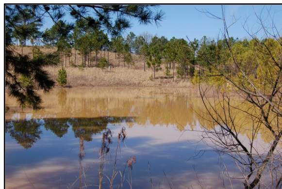
Figure 9: One of the ponds located at the Stump Dump (site four).

The stump-dump ponds (Figure 9) along Bain's Gap Road and the pits on the old Army fuel storage yard (former range 24a) on the south branch of Cane Creek produced high levels of anuran diversity (Table 2). These two sets of water bodies are both man-made and are good candidates for long-term monitoring. Adding new man-made ponds or restoring wetland habitat on the Refuge would create additional habitat for amphibians and can provide for a richer diversity of amphibian fauna.