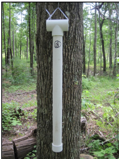
Figure 5: PVC refugia for Hylid treefrogs at site five.

Arboreal PVC Refugia: We sampled sites using polyvinylchloride (PVC) for the detection of Hylid tree frog presence. PVC refugia were deployed near pool breeding sites within streamside riparian zone habitats. Refugia were constructed from white PVC pipe (5.25 cm inside diameter X 80 cm long) that were fitted with a T fitting on the top and a cap on the bottom end that allowed them to hold water (Figure 5). All pipes were hung from trees with aluminum nails with the top being at a height of two meters and were positioned within shaded areas in the riparian zone not more than 20 meters from stream bank (Boughton et al , 2000; Smith et al , 2006). A total of 18 PVC refugia were arrayed in a linear transect 30 to 40 meters apart at four different locations. We emplaced all refugia during July of 2012 and checked them during our September 2012 and July 2013 efforts for occupancy. Arboreal PVC refugia were deployed at Cave Creek Seep, Upper Marcheta Mountain Seep, Lower Marcheta Mountain Seep and the South Branch of Cave Creek Seep (Figure 3; Table 1).