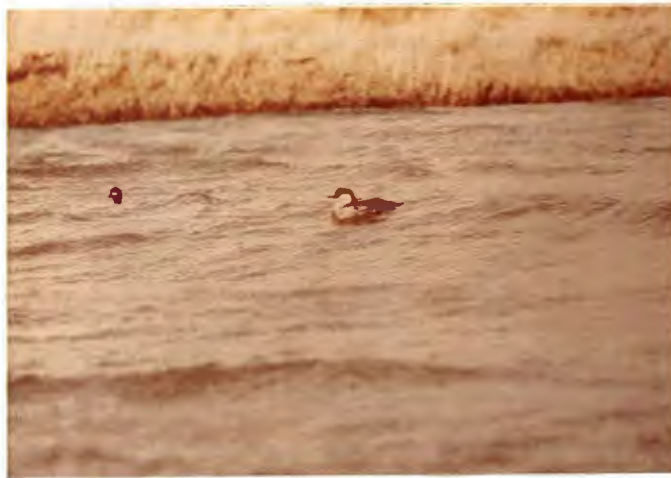
Figure 15. Record numbers of Snews were present at Adak during the winter of 1973-74.

A female Common Merganser observed at Buldir Island May 24 and 27 is an interesting locality and seasonal record.