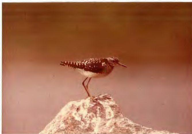
Figure 16. The Wood Sandpiper has recently been discovered nesting on Amchitka and Attu Islands.

Very little is known about the pelagic distribution of phalaropes along the Aleutian Chain, so the observation of several flocks totalling about 5,000 individuals seen north of Akun Island and in Unimak Pass August 13 is of more than passing interest.