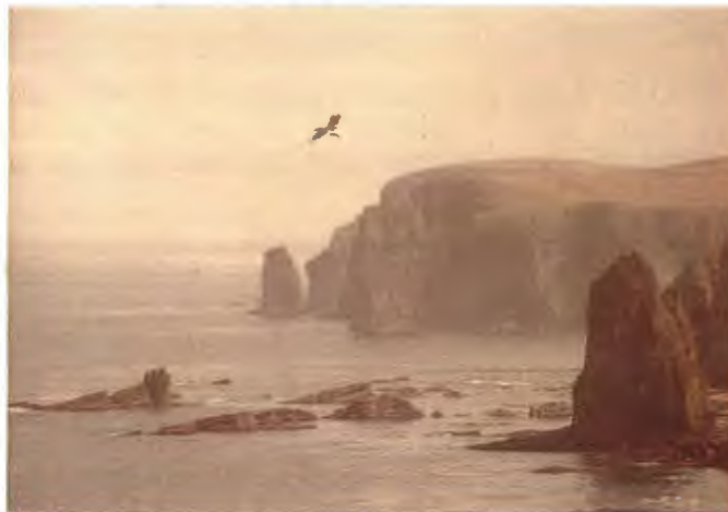
Figure 1. The rugged coastline of Agattu Island is typical of most islands of the Chain.

The Aleutians are the emergent peaks of a submarine mountain range, and may have appeared as islands as early as 8,000 years ago when the surrounding seas rose. Most of the islands are mountainous and the larger ones are dotted with lakes and cut by streams. Irregular shorelines have boulder or sand beaches, rocky cliffs, and off-shore islets and reefs. The Aleutian climate is characterized by fog, persistently overcast skies, frequent, often violent cyclonic storms, and high winds.