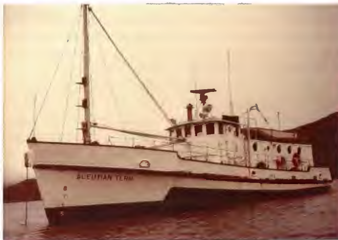
Figure 7. The refuge research vessel, M/V Aleutian Tern .

While Trapp and Craighead were following the activities of the released birds on Agattu, the other half of the party had proceeded to Buldir Island to study the breeding biology of the wild population. After sitting off the lee side of the island for five days, while sixty knot winds buffeted the Aleutian Tern , Byrd, Dau and Dick were finally able to make a landing on Buldir's rocky north beach on May 14.