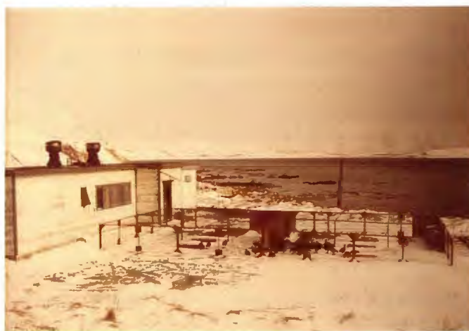
Figure 4. Aleutian Canada Geese in temporary holding pens at Attu field station.

Patuxent had 41 adult geese available for release in 1974. These arrived at Attu Island, where temporary holding facilities had been established, on March 22. The birds showed little ill effect from their five-day trip from Maryland, and were soon feeding and preening. The birds were held here, and daily observations of their behavior and activities were made, until May 5 when they were crated for shipment to Agattu.