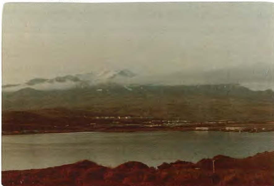
Figure 2. The U. S. Naval Station, Adak Island, site of refuge headquarters, is situated on the shore of Sweeper's Cove and at the base of Mt. Moffet.

At one time the Aleutians were the home of about 16,000 Aleuts, but their numbers were severely decimated following Russian discovery of the islands in 1741. Today, only two active villages exist on the refuge. Approximately 6,000 transient military and civilian personnel reside on the two major installations located on the refuge.