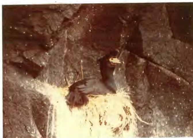
Figure 19. Red-faced Cormorants nest abundantly throughout the Aleutian Islands.

The Whiskered Auklet is perhaps the rarest of the small auklets, being confined in distribution to the Commander and Aleutian Islands. In the Aleutians it is encountered most frequently in the eastern Andreanof and Islands of Four Mountains groups, and is suspected of breeding on several of those islands. A single bird seen at Amak Island July 4 is nearly 100 miles east of the former easternmost record. Observations in recent years have shown that Whiskered Auklets number in the tens of thousands at least. They are much more abundant than Murie suspected.