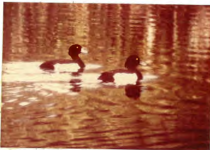
Figure 14. Tufted Ducks were recorded at five locations on the refuge during the spring of 1974.

The Barrow's Goldeneye is rare west of tree limit at the base of the Alaska Peninsula, so the following Aleutian Island observations are of interest. Up to three pairs were present at Unalaska Island in early April, 1974, and an eclipse-plumaged bird seen on Unalaska Lake, Unalaska Island on July 2, 1973 is the first summer record for the Aleutians.