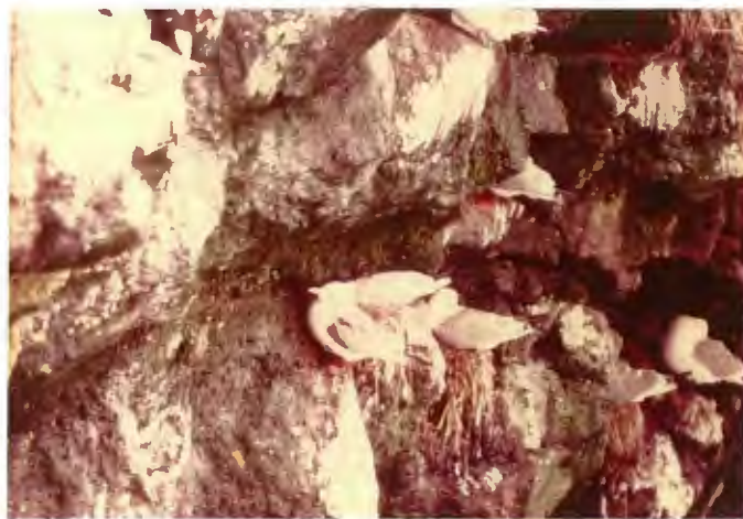
Figure 17. The rare Red-legged Kittiwake breeds at two locations in the Aleutian Islands.