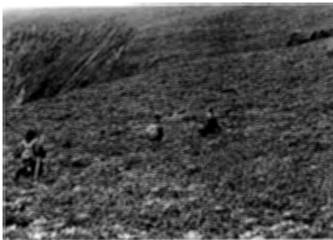
Figure 9. The lush vegetation of Buldir became increasingly difficult to walk through as the summer progressed.

A total of 119 birds were eventually banded with FWS aluminum bands and Orange or Blue colored leg bands.