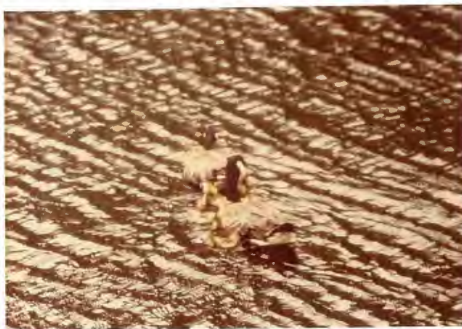
Figure 6. Aleutian Canada Goose brood on Agattu Island.

While Trapp and Craighead were following the activities of the released birds on Agattu, the other half of the party had proceeded to Buldir Island to study the breeding biology of the wild population. After sitting off the lee side of the island for five days, while sixty knot winds buffeted the Aleutian Tern , Byrd, Dau and Dick were finally able to make a landing on Buldir's rocky north beach on May 14.