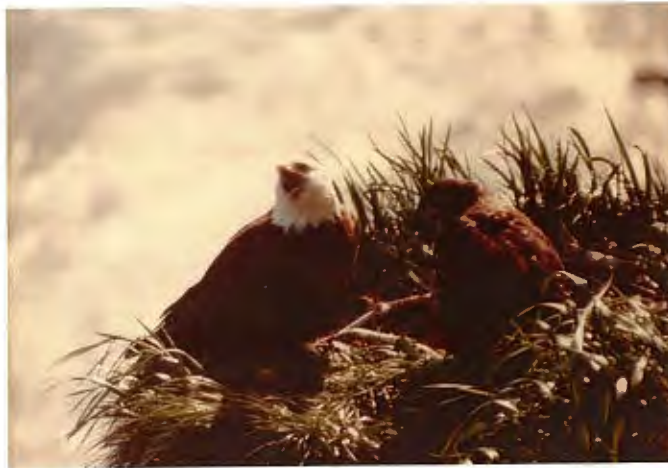
Figure 21. Bald Eagles continue to reproduce successfully in the Aleutians.

The Bald Eagle is common as a breeding bird as far west as Buldir Island (where 3 or 4 pairs nest), but is not found at all in the Near Island group. Apparently the present distribution is a reduction in range, as the bald eagle occurred in the Commander and Near Islands as the end of the 19th century.