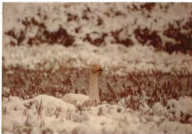
Figure 3. Whooper Swans are regular winter residents in the central and western Aleutians.

1. Whooper Swan . Whooper Swans were recorded at Attu, Adak, and Atka Islands during the winter of 1973-74, with the maximum count being the seven adults seen at Adak in early March. They were last seen at Atka in early April, and the last observation at Attu was April 9.