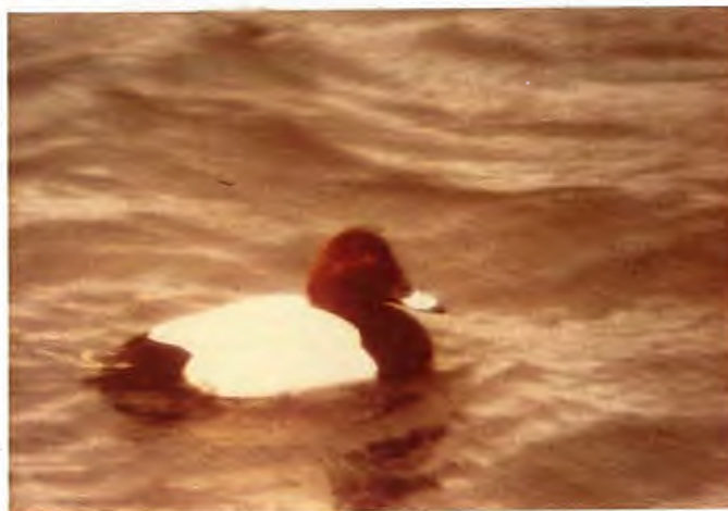
-Figure 12. The Common Pochard has been recorded annually in the Aleutian Islands since 1971.

The 30 Canvasbacks observed at Adak January 5 to March 6 is double the previous high count of 16 individuals there. Canvasbacks have been recorded annually at Adak since 1968, with the birds normally arriving about mid-December and departing by late April. The origin of this small, isolated wintering population is particularly interesting. The species is rare on the Alaska Peninsula during migration (Gibson, Condor 72: 242-243, 1970), and the only other winter record for Alaska is a single male present at Glacier Bay N.M. December 1970 to January 1971. The only other record of this species in the Aleutian Islands is based on the collection of humeri from an Aleut midden site on Amaknak Island (Friedmann, J. Wash. Acad. Sci. 27: 431-438, 1937).