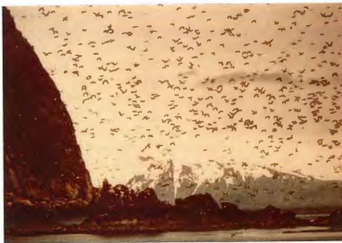
Figure 18. Spectacular concentrations of seabirds, such as this flight of murres, occur in the vicinity of colonies.

The Aleutian Island N.W.R. was established as "a preserve and breeding ground for native birds," among other things, and the most striking feature of many of the islands is large seabird colonies. Recent surveys indicate that an estimated minimum of 4,000,000 pelagic birds may breed on the refuge.