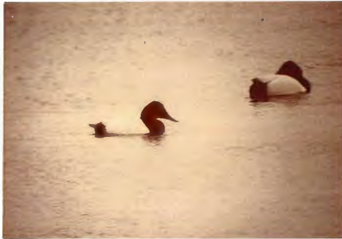
Figure 13. A small, isolated population of Canvasbacks has wintered annually at Adak since 1968.

Tufted Ducks were recorded at five different locations during the period (spring 1974). An adult male appeared at Attu Island April 19 and remained through the month. The species arrived in numbers May 2, with 10 birds present May 3-5. A single high-plumaged male was observed at Agattu Island May 13, and a pair was seen there June 5. A female was observed at Buldir Island on May 11, and a male was present there May 31 and June 1. An adult male was seen at Amchitka Island April 29, a single adult male was seen at Adak Island at irregular intervals in April, and a pair was present at Adak in late May and early June (D.D. Gibson, pers. comm.).