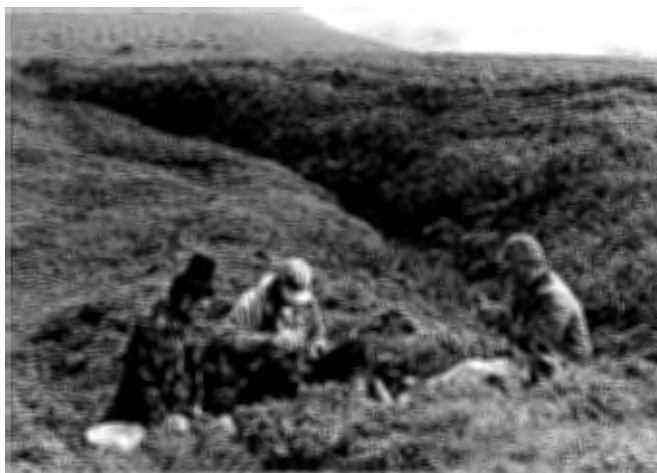
Figure 10. James C. Bartonek, Research Division; Christian P. Dau, and James Shaw, Area Office staff banding geese.

A total of 119 birds were eventually banded with FWS aluminum bands and Orange or Blue colored leg bands.