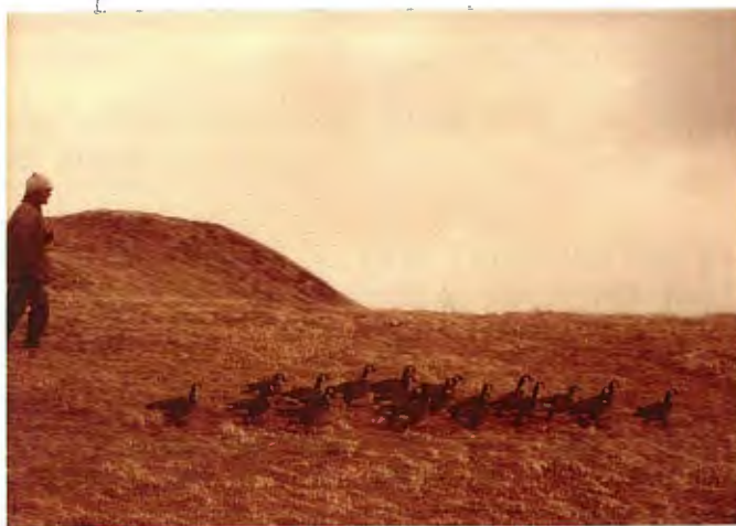
Figure 5. Flock of Aleutian Canada Geese shortly after release on Agattu Island.

Rough seas prevented a run to Agattu Island that evening, so the geese spent the night in the shipping crates below decks. We finally arrived at Agattu on May 6, hauled all our supplies ashore, erected goose pens, and established camp. The geese were held here for five days so that they could adjust to their surroundings. Finally, on May 11 the flightless, wing-clipped geese were released. The birds did not wander far from the Goose Lake release site during the summer, and soon pairs were establishing territories.