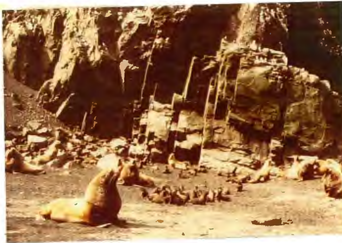
Figure 22. Photo of Steller's Sea Lions