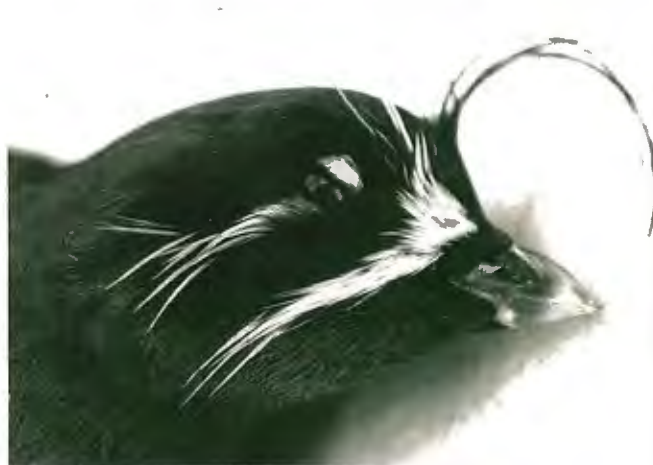
Figure 20. The Whiskered Auklet is the rarest, most poorly-known, and perhaps the most beautiful of the alcids.

The Whiskered Auklet is perhaps the rarest of the small auklets, being confined in distribution to the Commander and Aleutian Islands. In the Aleutians it is encountered most frequently in the eastern Andreanof and Islands of Four Mountains groups, and is suspected of breeding on several of those islands. A single bird seen at Amak Island July 4 is nearly 100 miles east of the former easternmost record. Observations in recent years have shown that Whiskered Auklets number in the tens of thousands at least. They are much more abundant than Murie suspected.