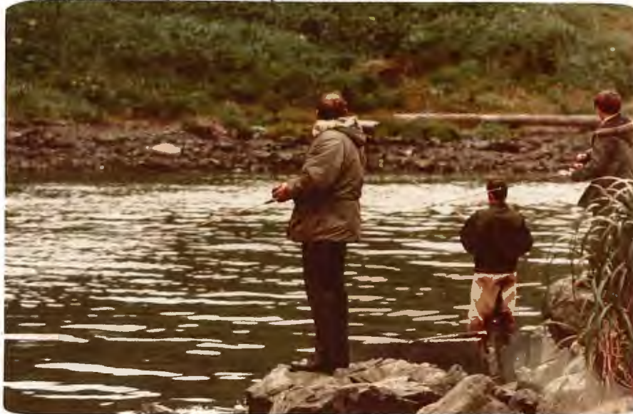
Figure 23. Salmon Fishing.

Hunting, fishing, beachcombing, and photography are the chief pursuits on the refuge. Over 6,000 people live on military bases on this refuge, and they account for the vast majority of the public use.