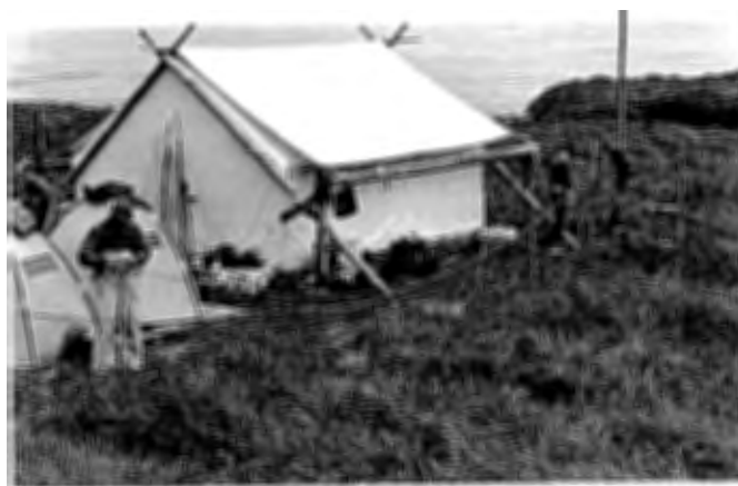
Figure 8. Campsite at Buldir Island.

A total of 32 nests were found at Buldir, and these contained an average of 5.4 eggs (range 3-7). Nesting success was 77 percent, and hatching success was 49 percent.