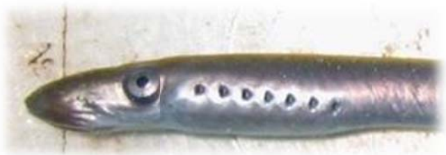
Juvenile Pacific Lamprey