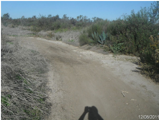
Photo: TISL_C4_0131 Route: 400-001-0.0 Begin Section