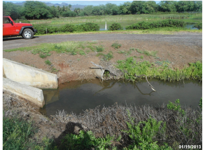
Photo: PEHA_C4_1077 Route: 401-002-0.06 Concrete Culvert 40ft long 18in dia. 3ft deep Asset# NA