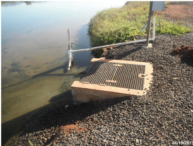
Photo: PEHA_C4_1065 Route: 400-002-0.29 Concrete WCS Flashboard Riser 25ft long 18in dia. 1ft deep Asset# NA