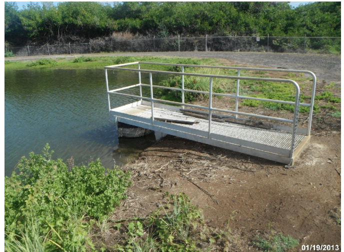
Photo: PEHA_C4_1079 Route: 401-002-0.15 Plastic WCS Flashboard Riser 45ft long 18in dia. 3ft deep Asset# NA