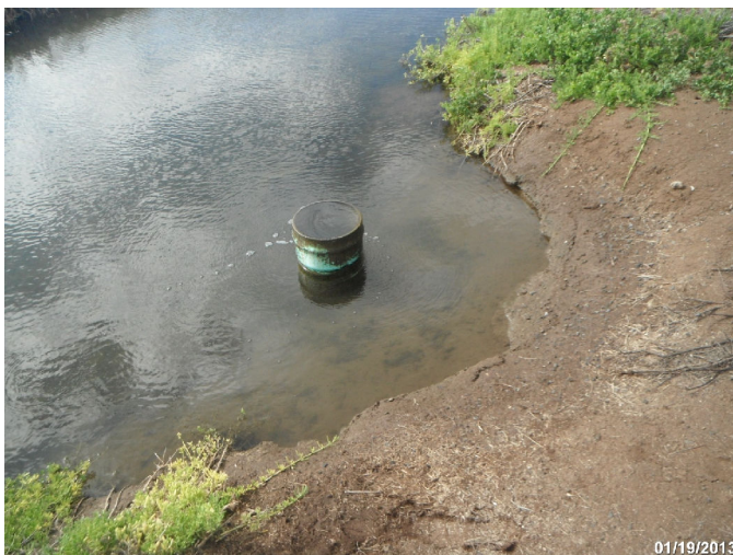
Photo: PEHA_C4_1080 Route: 401-002-0.15 Plastic WCS Flashboard Riser 45ft long 18in dia. 3ft deep Asset# NA