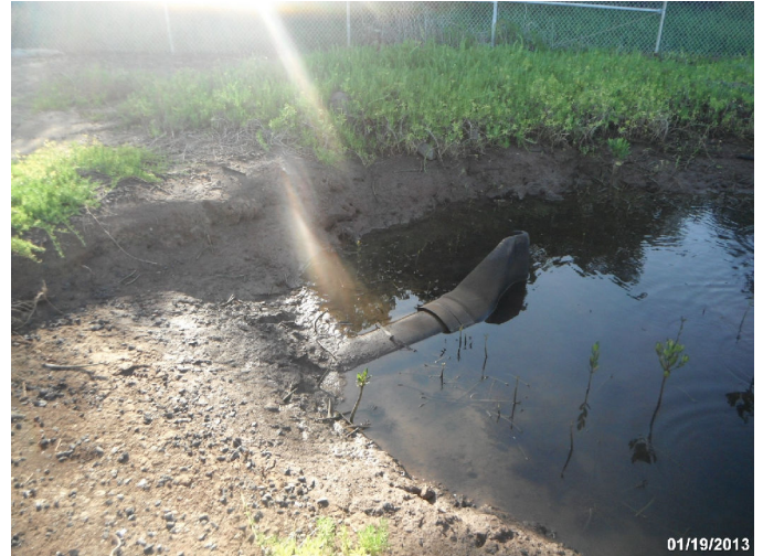
Photo: PEHA_C4_1062 Route: 400-001-0.36 Concrete WCS Flashboard Riser 22ft long 18in dia. 2ft deep Asset# NA