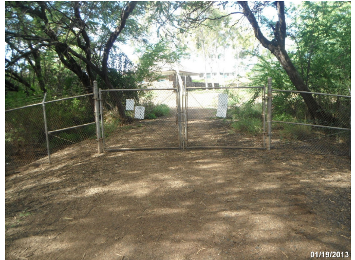
Photo: PEHA_C4_1071 Route: 401-001-0.01 Metal Chain Link Gate Asset# NA