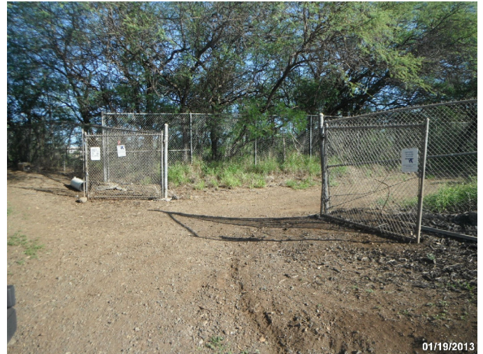
Photo: PEHA_C4_1060 Route: 400-001-0.0 Metal Chain Link Gate Asset# NA