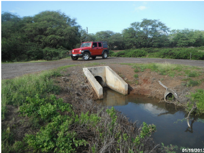
Photo: PEHA_C4_1072 Route: 401-001-0.06 Concrete Culvert 30ft long 36in dia. 2ft deep Asset# NA