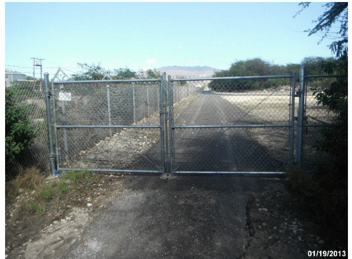
Photo: PEHA_C4_1082 Route: 402-001-0.0 Metal Chain Link Gate Asset# NA