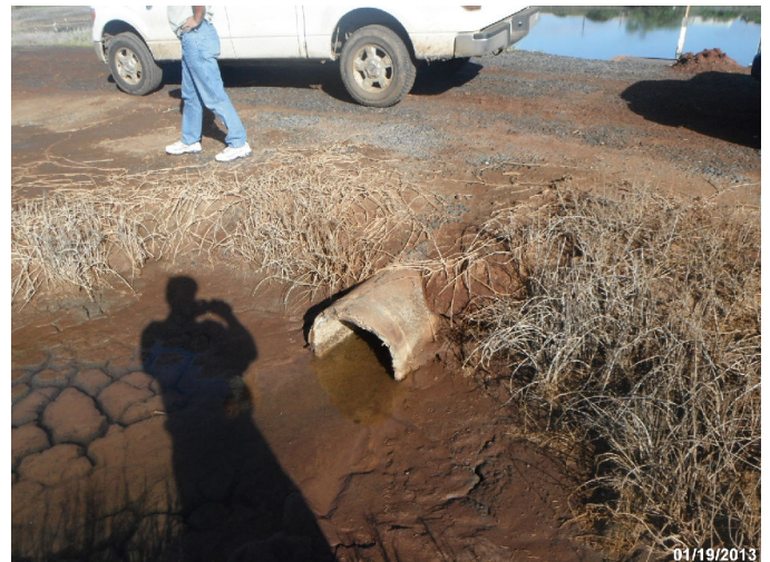
Photo: PEHA_C4_1064 Route: 400-002-0.29 Concrete WCS Flashboard Riser 25ft long 18in dia. 1ft deep Asset# NA 8-001