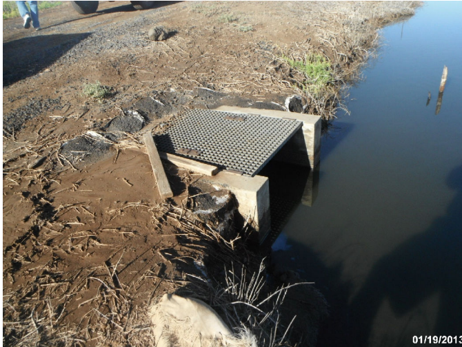
Photo: PEHA_C4_1061 Route: 400-001-0.36 Concrete WCS Flashboard Riser 22ft long 18in dia. 2ft deep Asset# NA