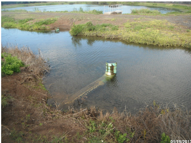
Photo: PEHA_C4_1074 Route: 401-001-0.6 Plastic WCS Flashboard Riser 40ft long 18in dia. 2ft deep Asset# NA