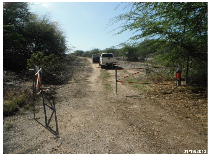
Photo: PEHA_C4_1084 Route: 403-001-0.0 Metal Open Rail Gate Asset# NA