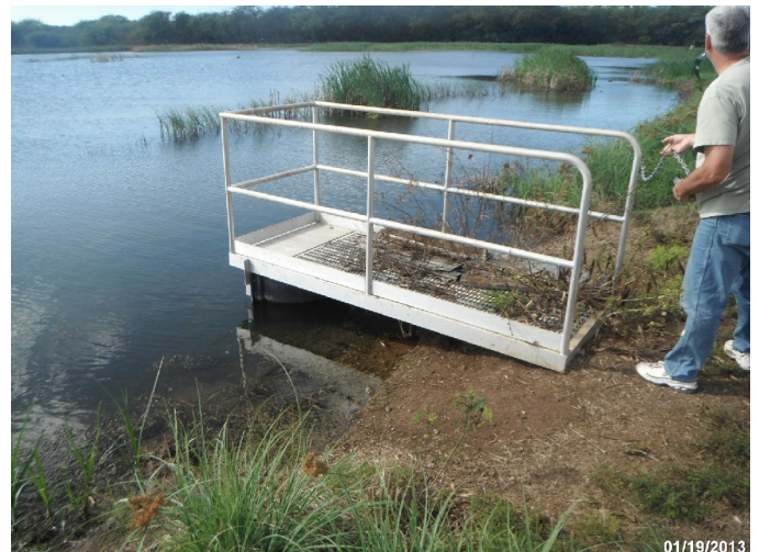
Photo: PEHA_C4_1075 Route: 401-001-0.6 Plastic WCS Flashboard Riser 40ft long 18in dia. 2ft deep Asset# NA 8-003