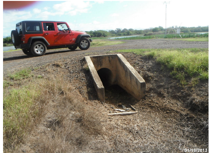
Photo: PEHA_C4_1073 Route: 401-001-0.06 Concrete Culvert 30ft long 36in dia. 2ft deep Asset# NA