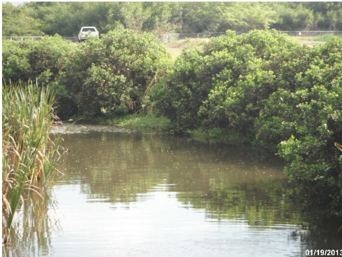
Photo: PEHA_C4_1078 Route: 401-002-0.06 Concrete Culvert 40ft long 18in dia. 3ft deep Asset# NA