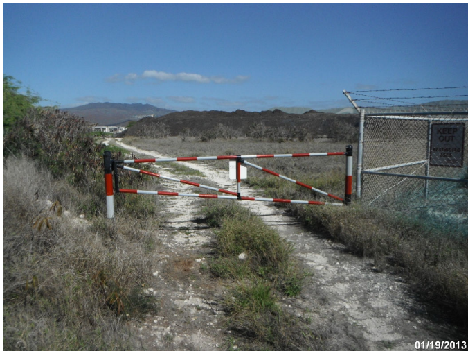
Photo: PEHA_C4_1086 Route: 403-001-0.76 Metal Open Rail Gate Asset# NA