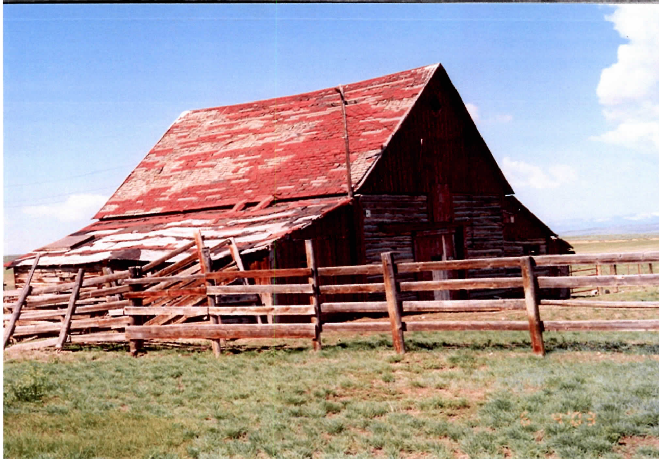
Figure 1: 1991 and 2003 photos of the north and east walls of the Hampton Barn. Note the deterioration of the shed roof and the wall collapse.