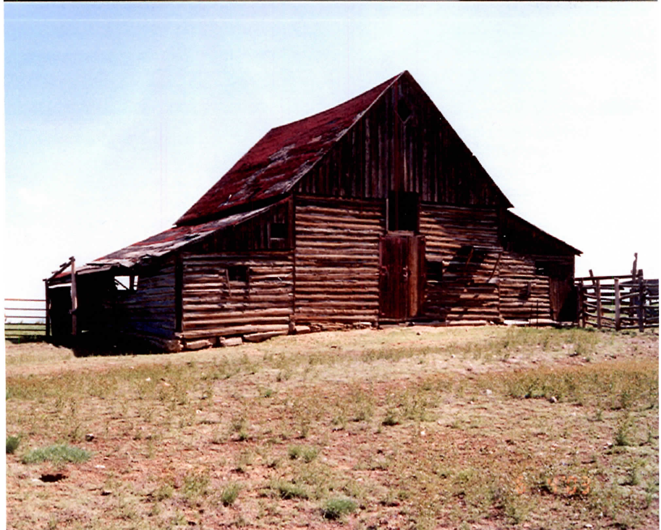
Figure 2: West and south walls of the Hampton Barn. Note the deteriorated shed room and