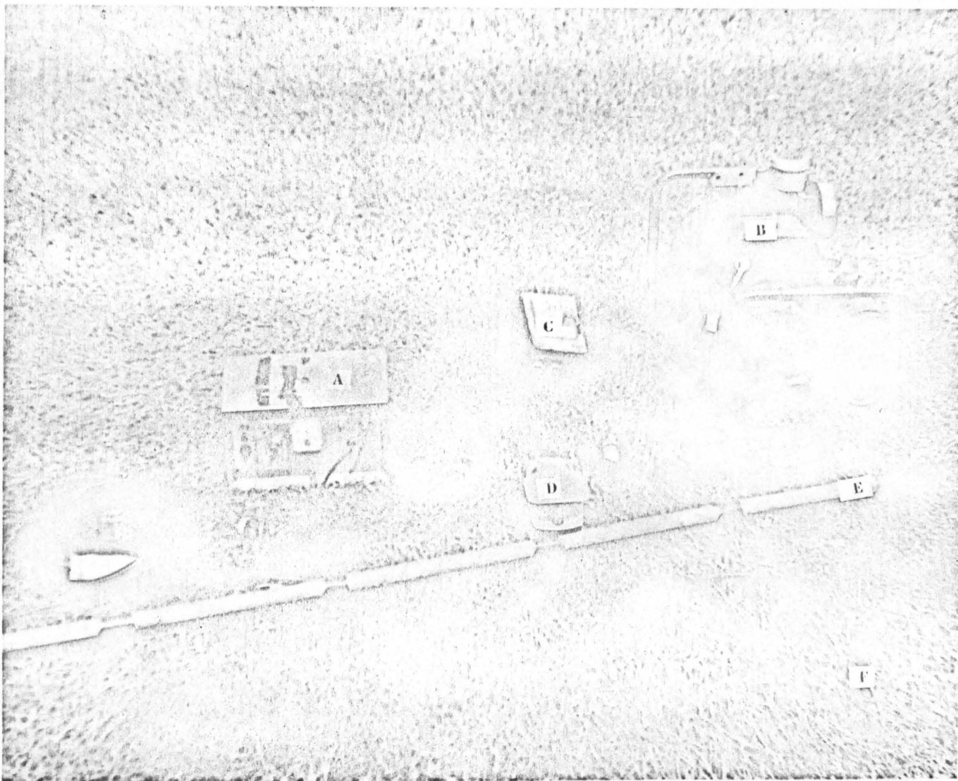
Figure 2 - The King Fisher pulsating D.C. unit, A; Kohler 120/240 volts A.C. generator, B; Square D Switch Box, C; Allen Bradley-Bulletin 905-Series D foot switch, D; prod pole, E; and the ground, F.