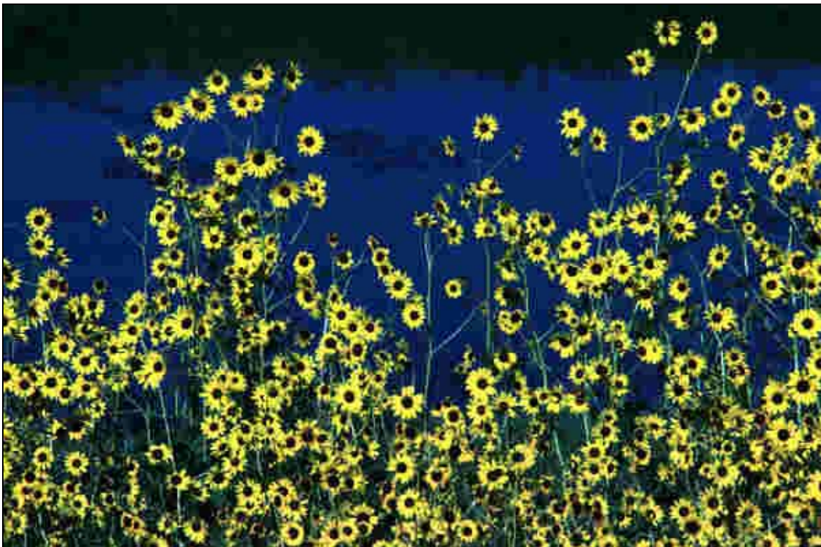
Figure 2. Pecos sunflower in bloom.

Pecos sunflower is an annual, herbaceous plant (Figure 1). It grows 1-3 meters (m) (3.3 - 9.9 feet (ft)) tall and is branched at the top. The leaves are opposite on the lower part of the stem and alternate at the top, lance-shaped with three prominent veins, and up to 17.5 centimeters (cm) (6.9 inches (in)) long by 8.5 cm (3.3 in) wide. The stem and leaf surfaces have a few short, stiff hairs. Flower heads are 5-7 cm (2.0-2.8 in) in diameter with bright yellow rays around a dark purplish brown center (the disc flowers) (Figure 2). Pecos sunflower looks much like the common sunflower seen along roadsides throughout the West, but differs from common sunflower by having narrower leaves, fewer hairs on the stems and leaves, smaller flower heads, and narrower bracts (phyllaries) around the bases of the heads. The prairie sunflower also has narrow leaves and phyllaries, but is distinguished from Pecos sunflower by having a white cilia