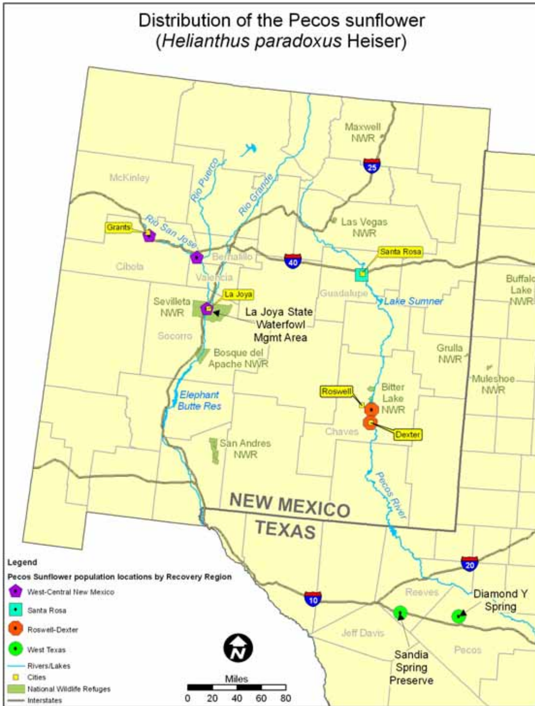
Figure 3. Distribution of Pecos sunflower populations.