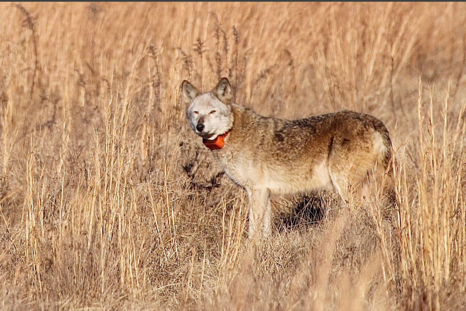
Female Red Wolf, 1743; Alligator River NWR, 2022