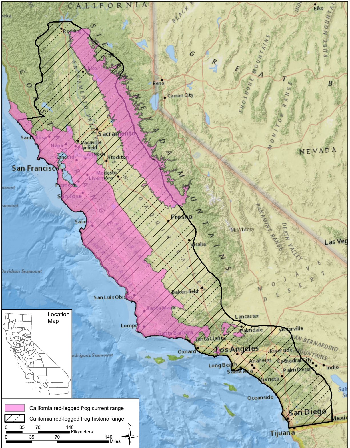
Figure 1. Current and historical range of the California red-legged frog. We do not include populations in Baja California, Mexico in this figure.