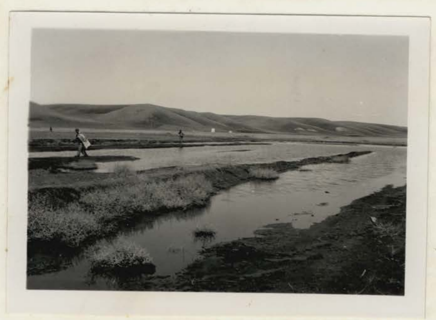
Millet behind the dyke and Bulrush in the lake.