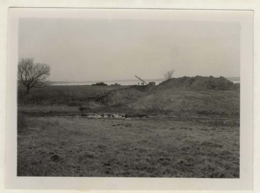
Ditching on Pelican Point and in the Riebe marsh.