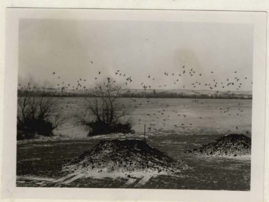
Baiting in the Waterfowl. (Canvasbacks, Redheads, Scaups, Pintails, Shovellers, and Mallards in this picture.)